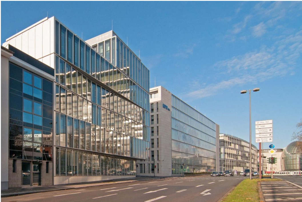
New building by Deutsche Investitions- und Entwicklungsgesellschaft, Agrippastrasse